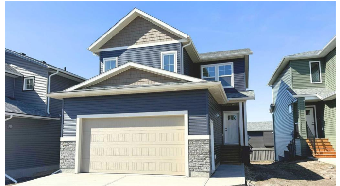
The REDMOND II 2,000 sq. ft.