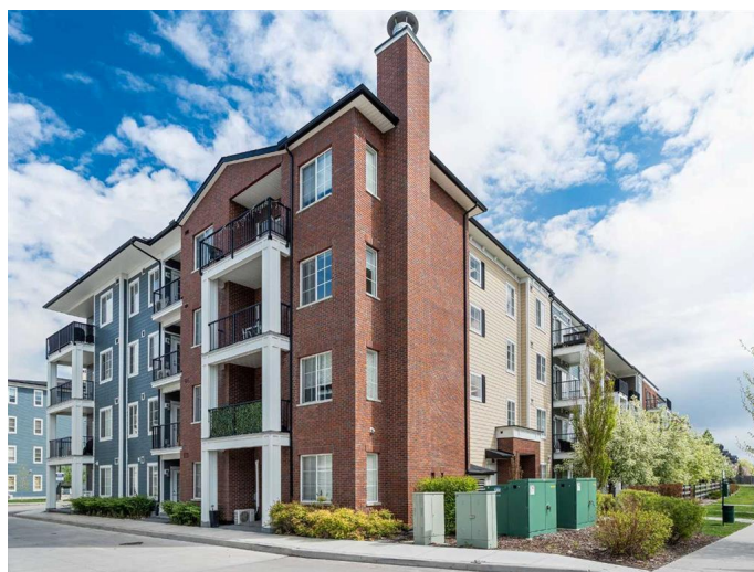
7309-151 Legacy Main St SE, Calgary, AB