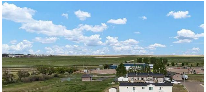
127 Meadowplace Dr E, Brooks, AB

Main Floor Exterior Area 1517.55 sq ft Interior Area 1381.31 sq ft